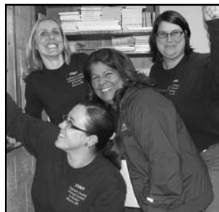
ICAC STAFF CELEBRATE ADOPTION