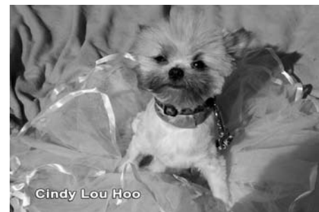
Cindy Lou Hoo