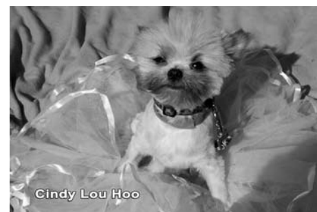
Cindy Lou Hoo